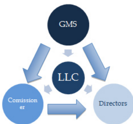
Figure 1 structural composition of an ordinary company